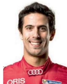
Lucas di Grassi

Date/place of birth: Aug 11, 1984/ São Paulo (BR) Place of residence: Monaco (MC) Career highlights: 2005 1st Formula 3 Grand Prix Macau, 2010 F1 driver, 2012 3rd 6h São Paulo, 2013 3rd 24h Le Mans, 2014 2nd 24h Le Mans, 4th WEC